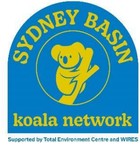
Sydney Basin Koala Network