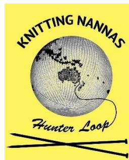
Knitting Nannas Hunter Loop