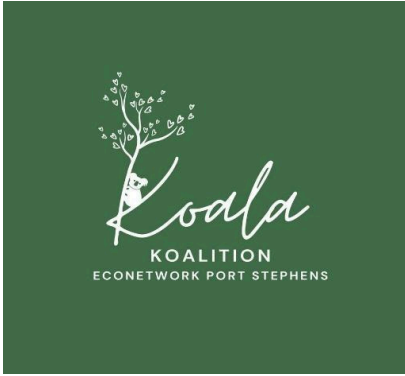
Koala Koalition EcoNetwork Port Stephens (KKEP)